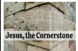
Jesus, the Cornerstone

As the number of disciples continued to grow . . . The word of God continued to spread, and the number of disciples in Jerusa- lem increased great- ly; even a large group of priests were becoming obe- dient to the faith.